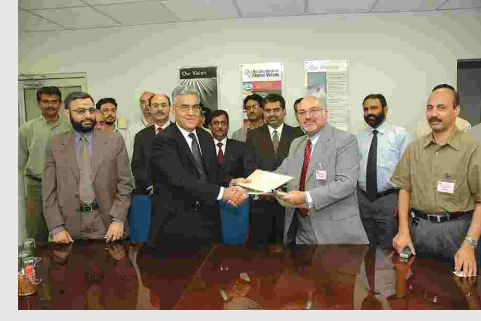
An agreement between Abacus Consulting and Dadex Eternit Ltd. was recently signed in Karachi for the implementation of SAP software. Abacus Consulting are authorized to implement SAP in Pakistan.

Dadex signs SAP Implementation Agreement with Abacus Consulting